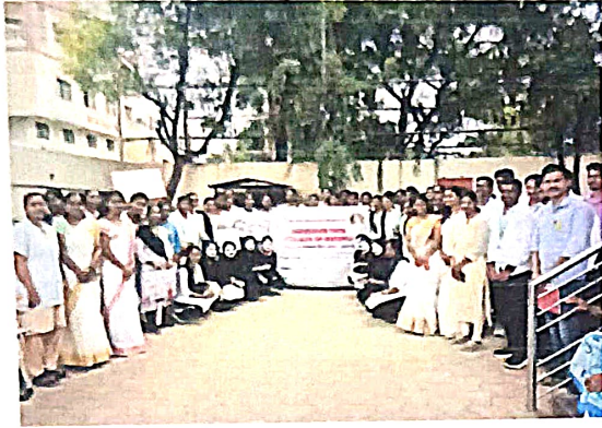
World Suicide Prevention Day