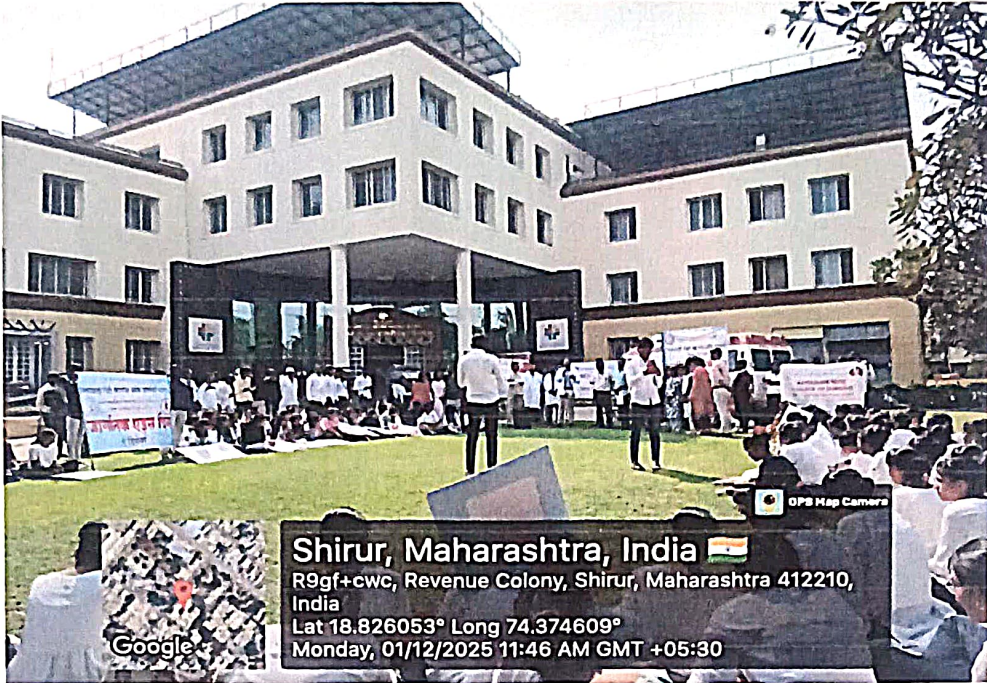
World HIV and AIDS Awareness Day