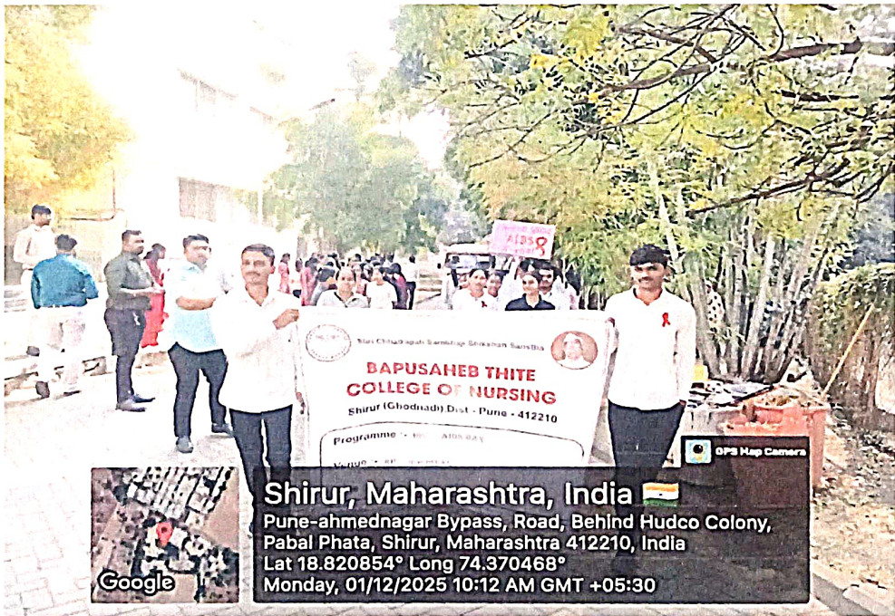
World HIV and AIDS Awareness Day