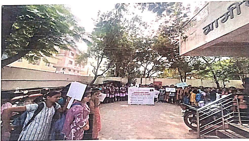
Mental Health Day Awareness